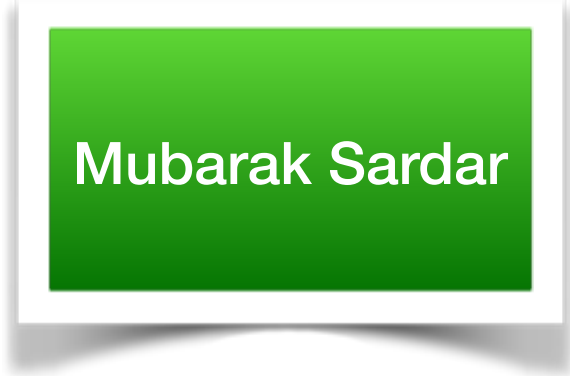
Trustee Apr 2023 - Present