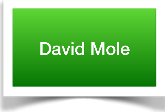
Trustee Jul 2020 - Present