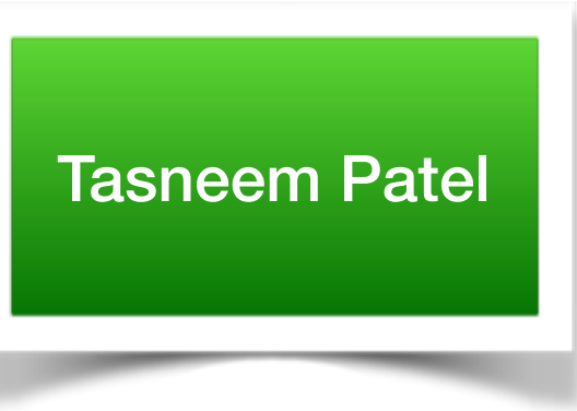
Trustee (Vice Chair) Sep 2021 - Present