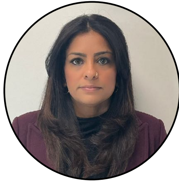
Class RA Teacher & EYFS Lead: